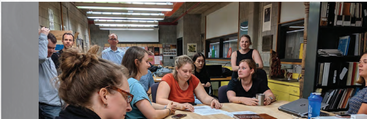
Historic Preservation students with professors in the Estopinal College of Architecture and Planning.