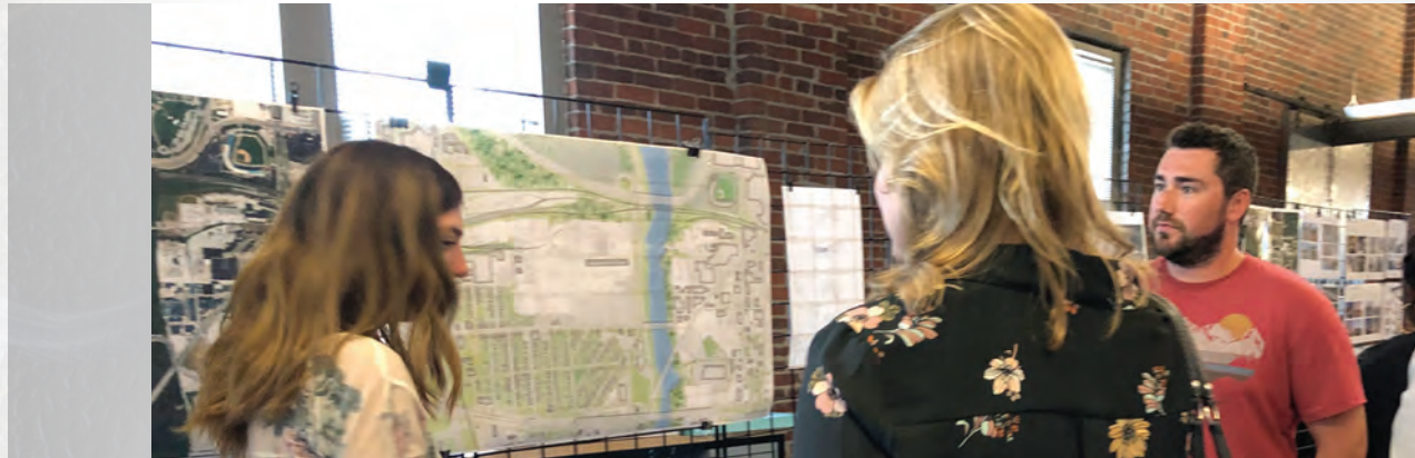
An open critique and review of work in the CAP: INDY studio.