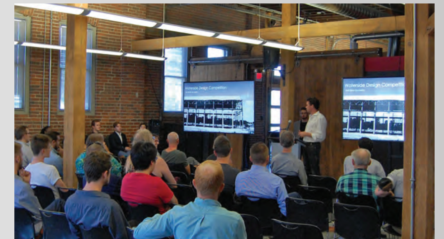
Students present their work to a jury of peers, professors, stakeholders and community members.

For their assistance in either teaching, research, or service work, graduate assistants receive a stipend along with a partial tuition waiver. Graduate assistantships are available to qualified master's students based on merit. We also align students with architecture firms to establish part-time work opportunities while studying in both Indianapolis and Muncie. The student interns are available for this internship a minimum of 15-hours per week, consistently organized around scheduled classes.