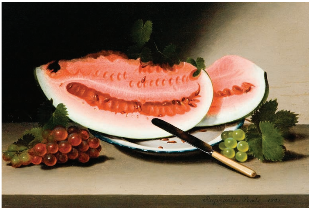
Watermelon , signed and dated 1821 Raphaelle Peale American, Oil on panel Virginia Ball Collection Anonymous loan L001.2006

Copper, Magenta , 2005 Judy Ledgerwood American, b. acrylic, gouache, oil and metallic oil on canvas Courtesy of Rhona Hoffman Gallery, Chicago L2006