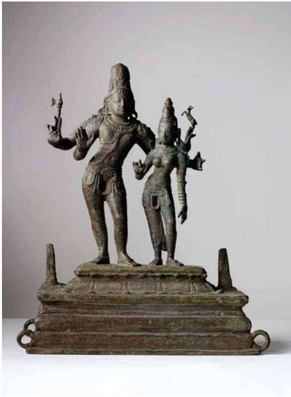
Festival Image, Shiva and Parvati , about 1000 CE South India, Tamil Nadu, Chola Dynasty (860–1279 CE) copper alloy Purchased in honor of David T. Owsley 2005.011

Indian bronze to enter the collection. Among other important purchases was Roger Brown's 1992 painting Beaters, Burglars, and Burners , the capstone on a collection of paintings and works on paper by the Chicago Imagists that were assembled by the museum in the early 1970s.