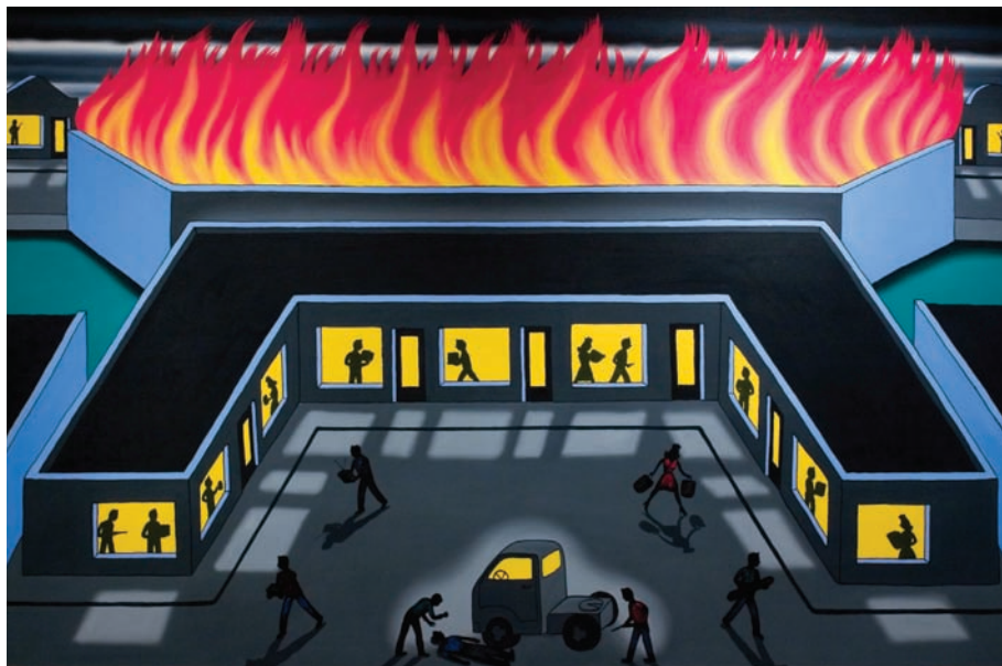
Beaters, Burglars, and Burners , 1992 Roger Brown American, 1941–1997 oil on canvas Purchase: Museum of Art Endowment Fund 2005.012

American Paintings: 1800–1900 North Gallery