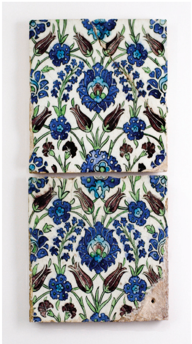
Two Iznik tiles from Laurelton Hall