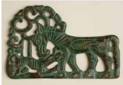
Ordos Culture China, Inner Mongolia Belt Plaque , 4 th / 1 st Century BCE bronze

Gift of David T. Owsley via the Alconda-Owsley Foundation 2009.014.000