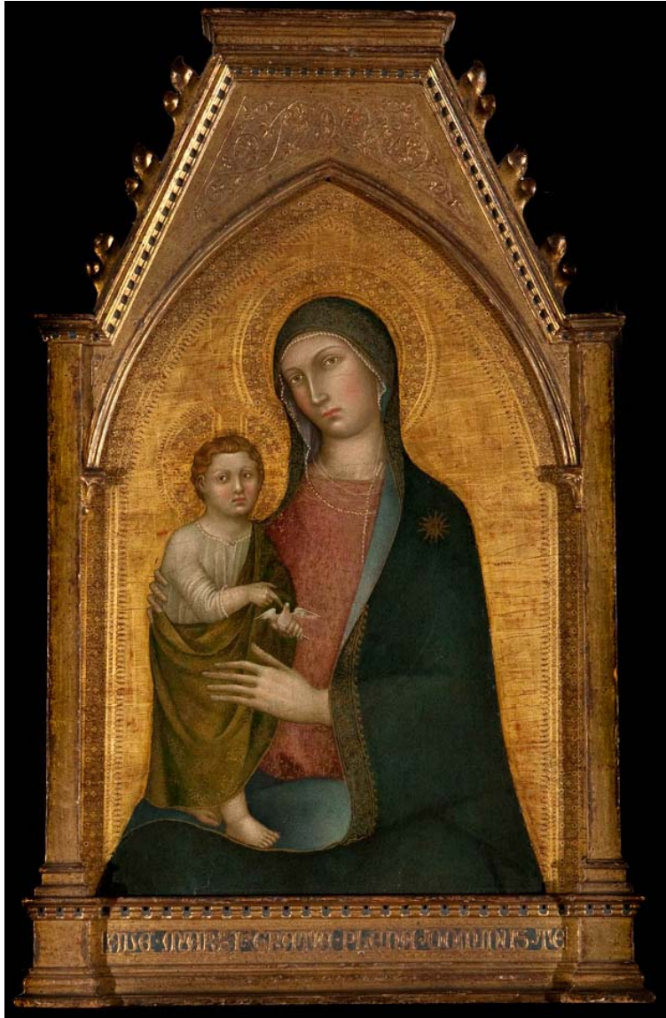
Taddeo di Bartolo Italian, Siena, c. 1362-c. 1422 Madonna and Child , c. 1400 tempera on panel