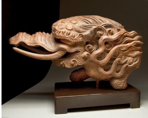
Baku , late 18 th /early 19 th century wood