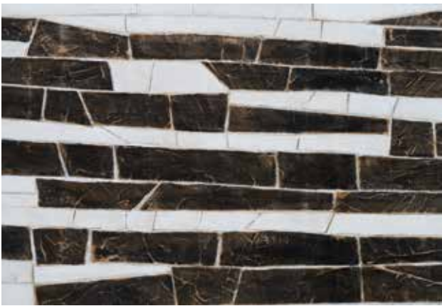
◀ Detail of Porcelain Earth , 2023, marble dust on canvas, 60 x 84 in.

and impermanence. She loves old walls, faded frescoes, peeling paint, creased leathery faces, the iconography of early civilizations and the study of languages. These elements are filtered through her years as a graphic designer, which trained Ma's eye for modern typography and architectural forms.