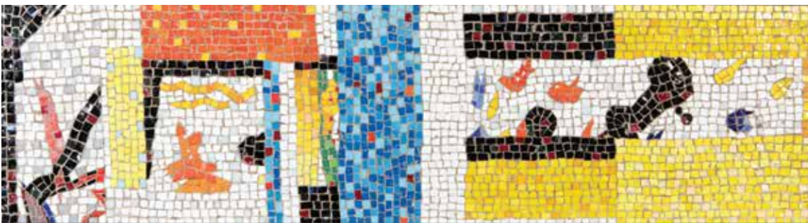
◀ Hans Hofmann, designer, American, born Germany (1880-1966) and L. Vincent Foscatto, mosaicist, American (about 1887-1968), Maquette for Mural at the New York School of Printing, 1957, glass tile set in concrete, David T. Owsley Collection L2022.005.000.