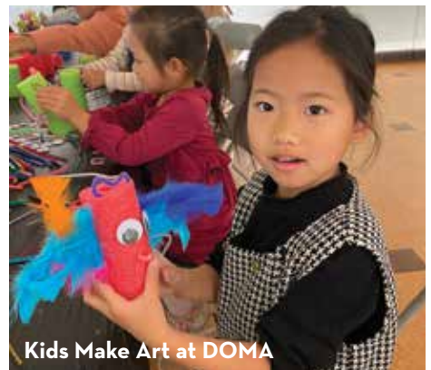
Kids Make Art at DOMA

Visit bsu.edu/doma for more information.