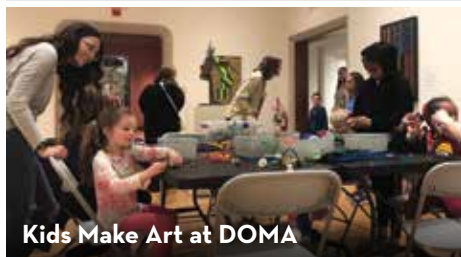
Kids Make Art at DOMA