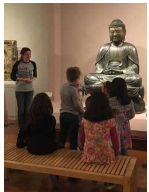
▲ Families enjoy a "Kids Tour" at DOMA.