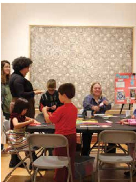
▲ Ball State Art Education students demonstrate how to create a Picasso style portrait.