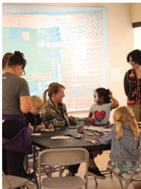
▲ Children and families play with patterns while creating masks.