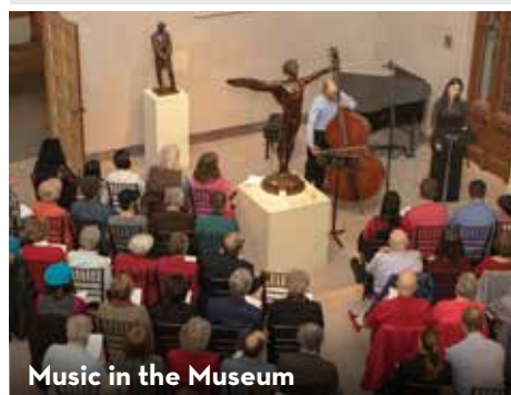
Music in the Museum

Students from the School of Music, Honors College, and the Delaware County community perform works from the Baroque period to celebrate the special exhibition Beyond the Medici . Visit bsu.edu/doma for more information.