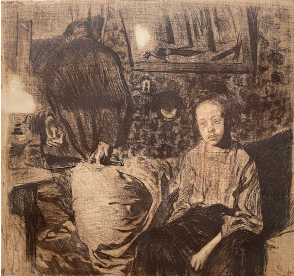
◀ Käthe Kollwitz (German, 1867-1945), The Young Couple (Junges Paar), 1904, soft-ground etching, The David and Sarojini Johnson Print Collection.