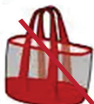
OVERSIZED TOTE BAG