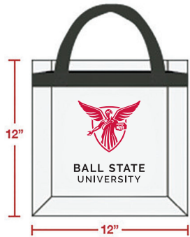
CLEAR TOTE Plastic, vinyl or PVC No larger than 12" x 6" x 12"