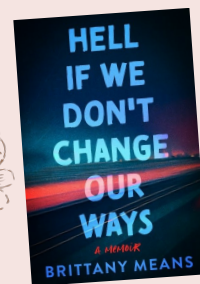
Creative Nonfiction Author & BSU Alum Brittany Means