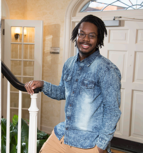
Edmund F. and Virginia B. Ball Honors House

The Honors College offers a comprehensive honors program for students of high academic promise and achievement. Founded in 1959, the college fosters innovation in research, teaching, and learning through an independently created liberal arts curriculum, engaged faculty, and an active living-learning community.