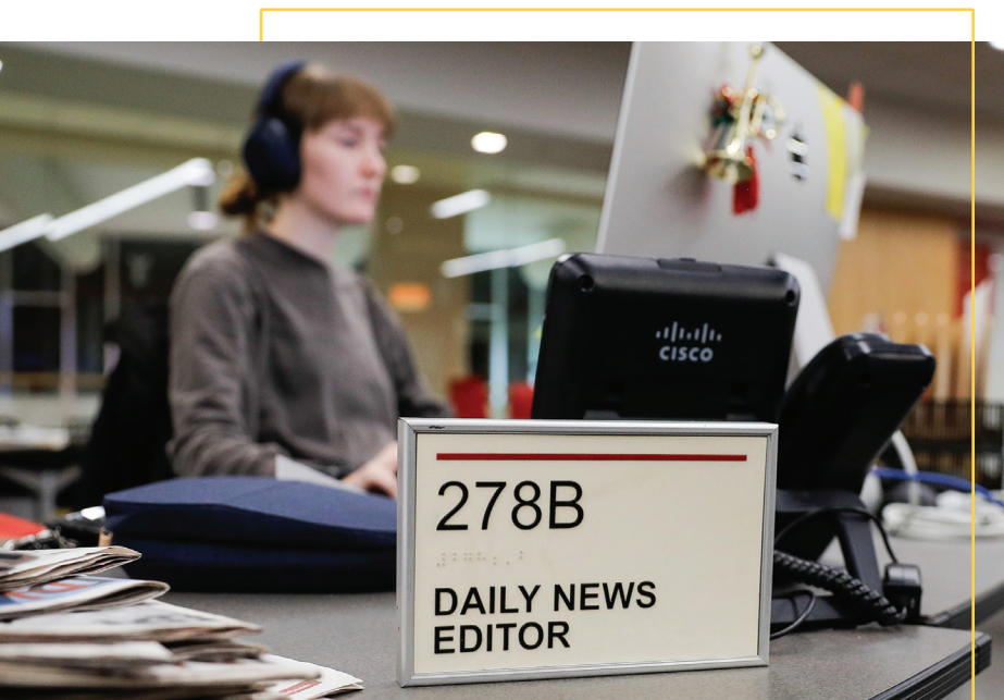
Students work in the Unified Media Lab on different design opportunities with our student publications, including Ball Bearings Magazine and the Ball State Daily News.