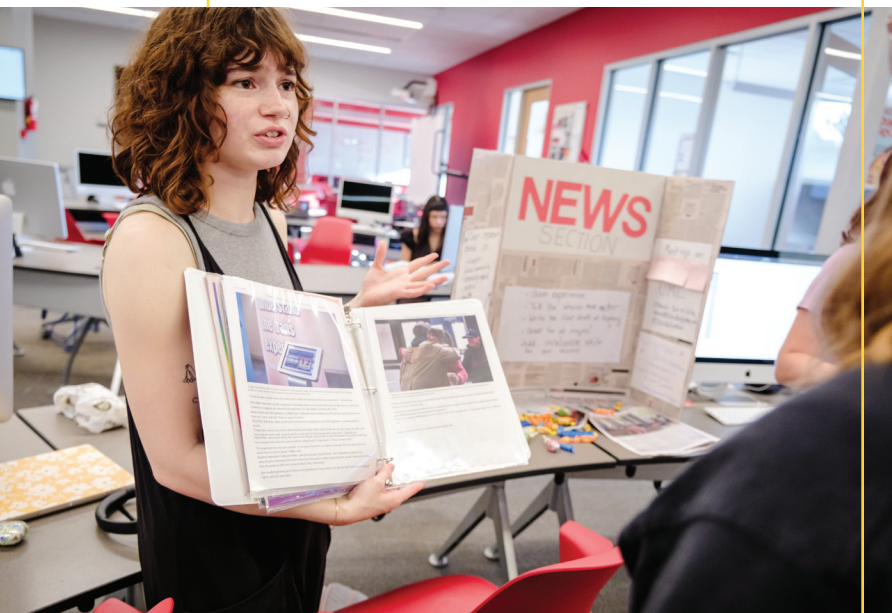
Students from the Ball State Daily News recruit new members during SuperParty, CCIM's yearly activity fair, connecting aspiring journalists with on-campus media opportunities.

The Indiana Journalism Award recognizes outstanding achievements in Indiana journalism among writers, reporters, columnists, editors, publishers, foundations, media outlets and auxiliary organizations.