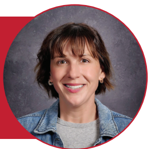
Marilyn Weaver Scholastic Journalism Award