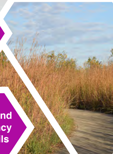
Red-tail Land Conservancy nature trails