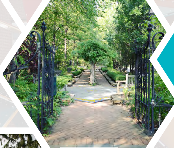
Minnetrista's historic mansions & gardens