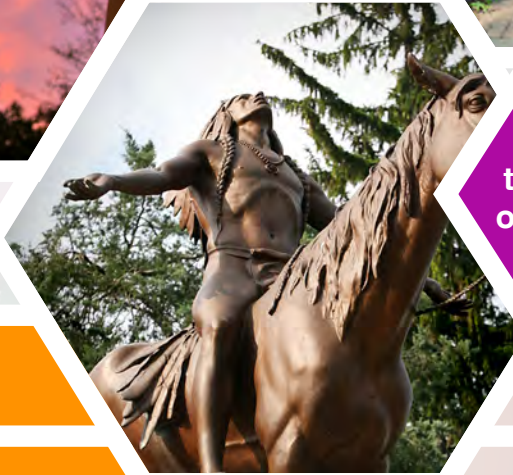
Appeal to the Great Spirit on North Walnut Street