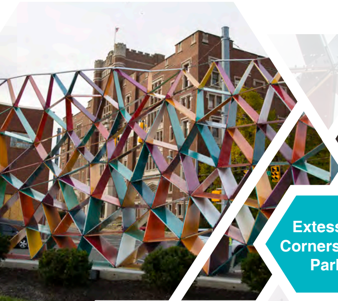
Extess in Cornerstone Park