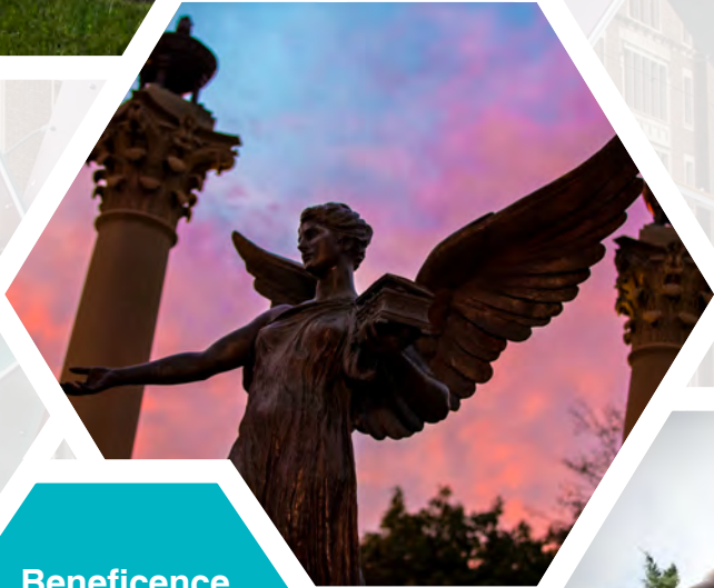
Beneficence statue at sunset