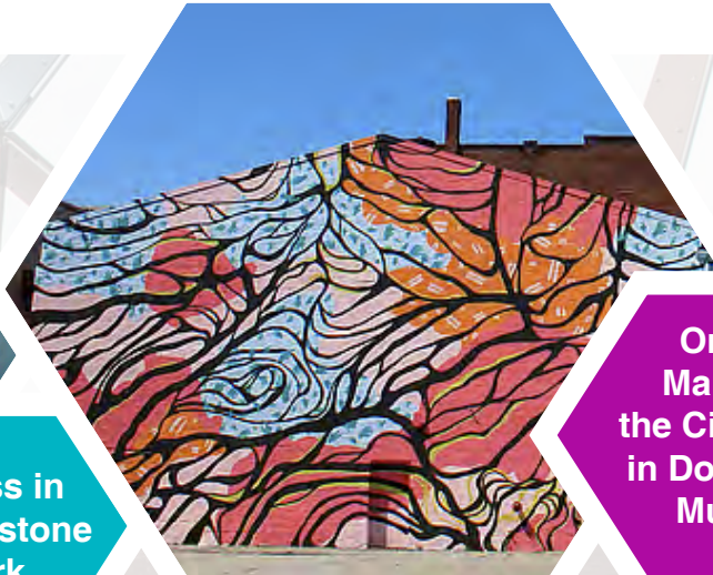
On the Mark For the City mural in Downtown Muncie