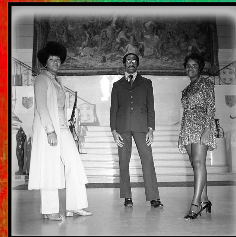
Afro-American Student Union Officers (1971)