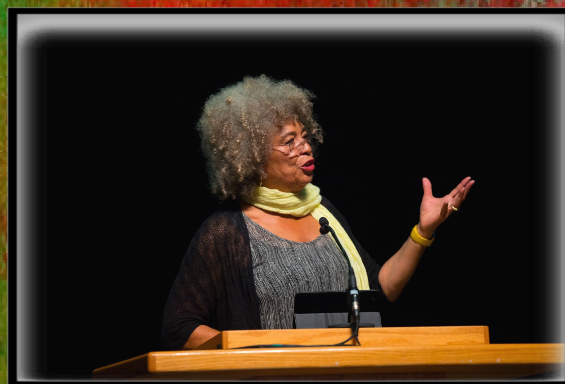
Angela Davis speaking at Emens Auditorium on September 22, 2017.

A visit from speaker, legendary activist, academic and author Dr. Angela Davis on "Institutional Racism in the Penal and Criminal Justice System" marked the relaunch of the program in 2017 .