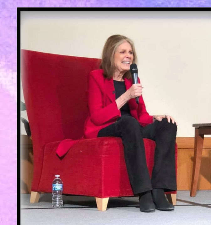
Gloria Steinem speaking during Women's Week in the Student Center Ballroom (2019)

In 2019 , Gloria Steinem returned to speak during Women's Week. She was also a keynote speaker in 2002 . The first Women's Week programming was held in April of 1984 .